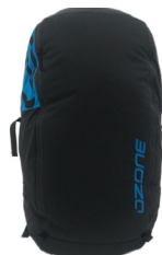
Rucksack Improved Comfort and Functionality