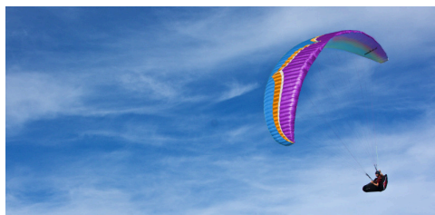
Swift 5 GLIDER Lightweight Sport-Intermediate Performance