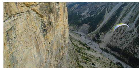
XXLite2 GLIDER World's Lightest Aircraft