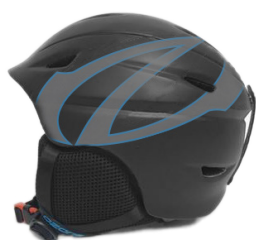
Shield Helmet Modern Lightweight Protection