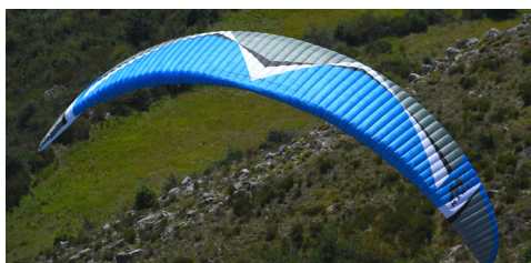
M7 MANTRA GLIDER The Next Generation of Ultimate 3-Liner