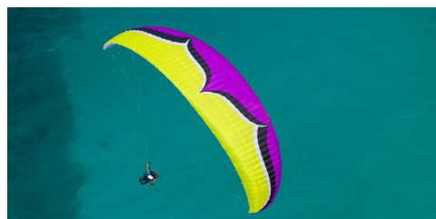
MAGNUM3 GLIDER The Professional Choice