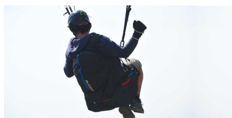
OXYGEN 2+ HARNESS All New For 2019